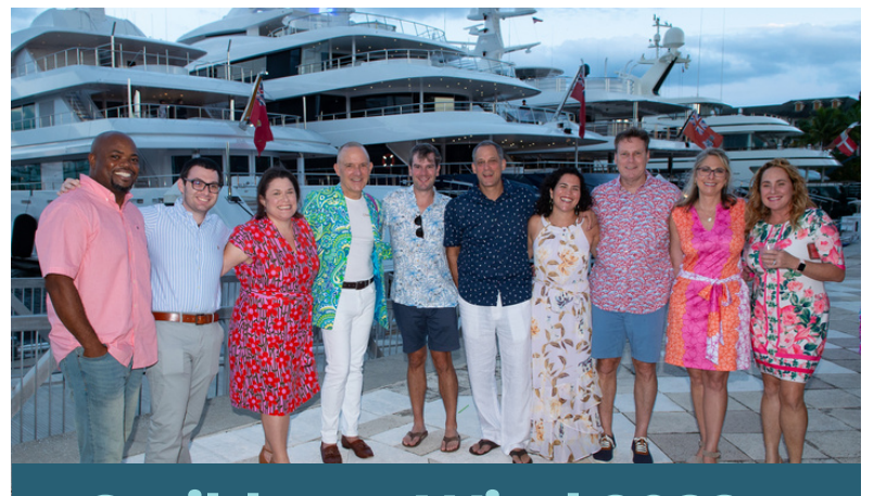
Caribbean Wind 2022