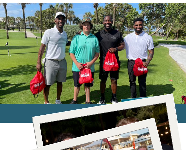
Caribbean cannot 22 wind 22