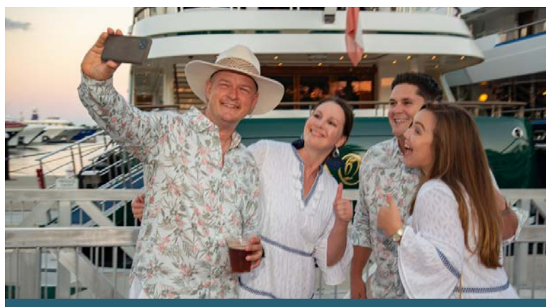
Caribbean Wind 2022